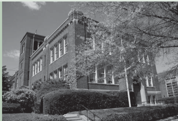
The St. Andrew Avellino "old" school building on 158th Street.